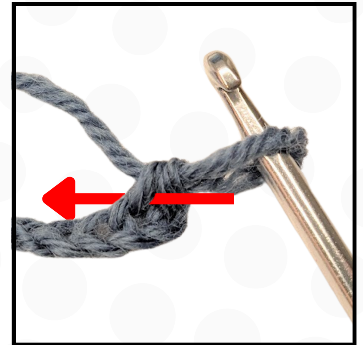
Identify the loop furthest away from your dominant hand

You will see that, by creating a single on top of a single, you have also created two V's.